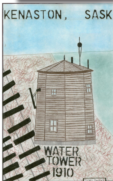
Tyler Decker Clear Spring School, Kenaston Railway water tower in Kenaston