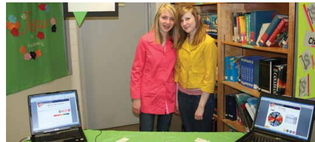
Students and staff launched The Real Game – Saskatchewan career education tool at St. George School.

In our high schools, we're pioneering a brand-new "career practitioner" position – it's a first for Saskatchewan. This person oversees several aspects of career education at the school – helping students map their futures, access career planning tools and develop skills that will help them reach their goals.