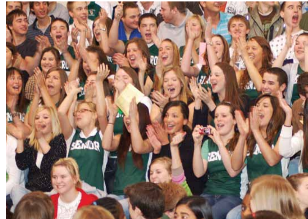
In spring several high schools hold Box Lunch Auctions, where home room classes and staff create themed meals that are sold to the highest bidder. The Holy Cross event has raised more than $25,000 for charity in one day.

Each year during Lent, students undertake a variety of service and fund-raising projects as part of their spiritual preparation for Easter. In 2009 nearly $100,000 was raised by students and staff in 45 schools. Funds made a difference locally, nationally and around the world in Brazil, Kenya, Gambia, the Philippines, Tanzania, Nigeria and Ecuador.